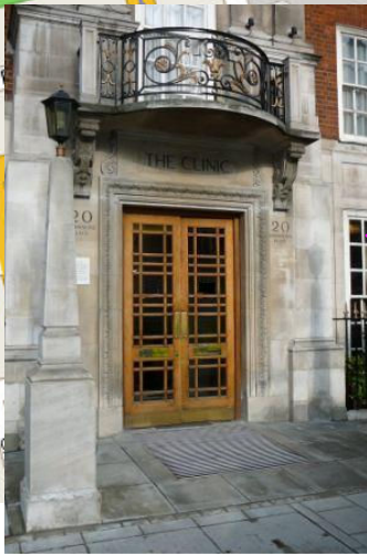
THE LONDON CLINIC