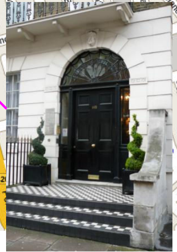
145 HARLEY STREET